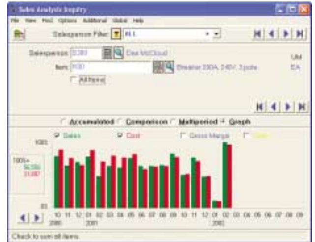
Sales Analysis Inquiry: Managers can easily view sales history for customers, salespeople, items and/or branches in a variety of formats.

Plumbing, HVAC, electronics, healthcare, chemical – regardless of the industry, TakeStock is a flexible software package that can be tailored to meet the specific needs of nearly any distribution business. Backed by over twenty years of software experience and proven technology platforms, TakeStock allows distributors to redefine efficiency, convenience and productivity within their business.