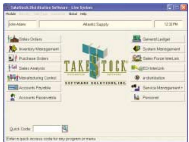
TakeStock Main Menu: TakeStock presents a wealth of powerful distribution applications in a graphical, easy-to-use Windows interface.

SYSTEM MANAGEMENT provides added system benefits and allows customized and personal menus, maintains a central notes system, provides flexible security settings and empowers your staff with Management Alerts.